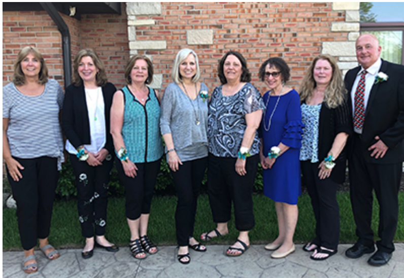
2018 District 41 retirees