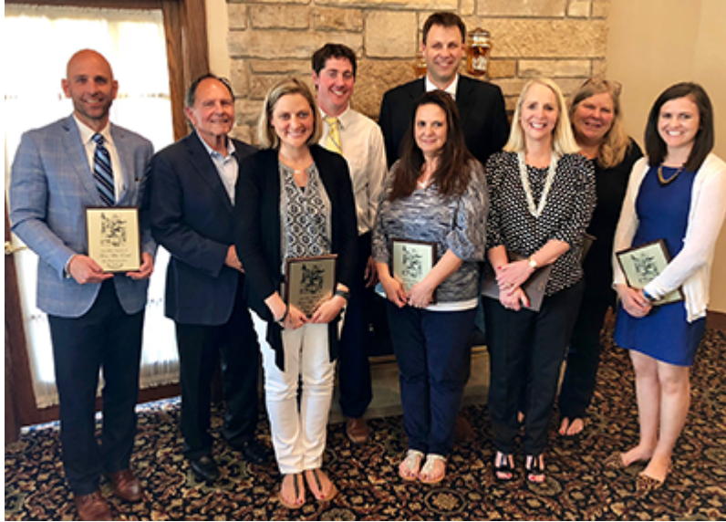
'Those Who Excel' winners