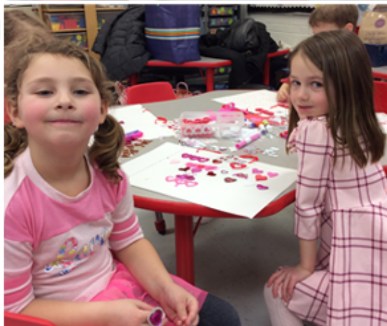
Forest Glen students enjoying Valentine's Day today.