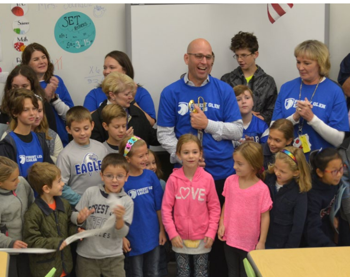
Forest Glen ribbon cutting, October 3