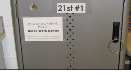
locked recharging cart when not in use.

More seating styles; soft, super-lightweight Individual portable devices such as netbean bags accommodate all sizes of students books and iPads are safely stored in a and are easily moved around the room.