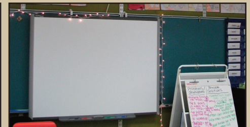
Sleek ceiling-mounted projector connects to the SMART Board; students enjoy leading lessons using the interactive touch-screen.