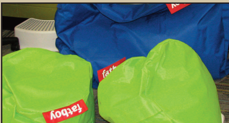
More seating styles: soft, super-lightweight bean bags accommodate all sizes and are easily moved around the room.