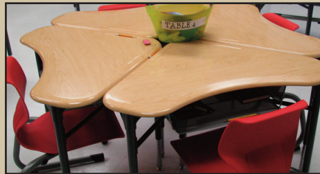
Desks are easily grouped and regrouped for collaborative work.