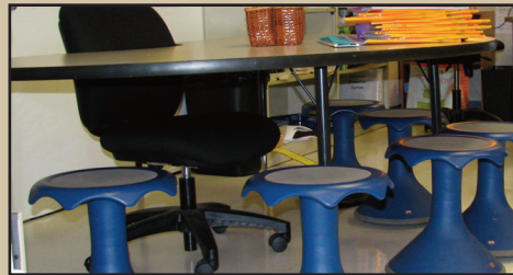
Ergonomic stools allow students to perch and rock a bit in comfort.