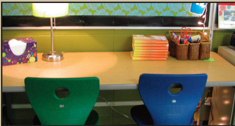
A variety of learning areas, such as this cozy corner for two, suit quiet, active, group and individual learning.

to support our focus on the D41 Learner Characteristics and lively, interactive learning. We started small with six "model classrooms," and are adding more each summer as we transform all of them to 21st century classrooms. These costs are part of our normal classroom and technology replacement cycles.