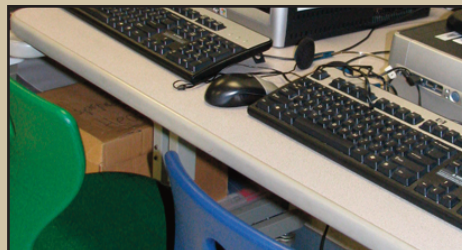
Desktop computers augment the portable devices. Students access Web-based tools for learning from desktop or portable devices.