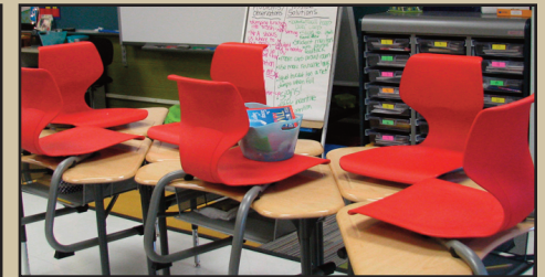
Lightweight chairs lift easily onto the desk-top at the end of the day in preparation for the custodian.