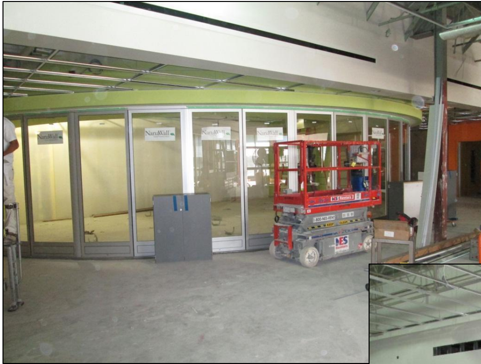
Nana wall and framing for "store front" reading and quiet rooms