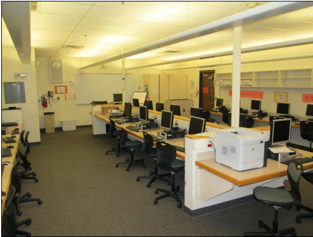
Existing computer labs