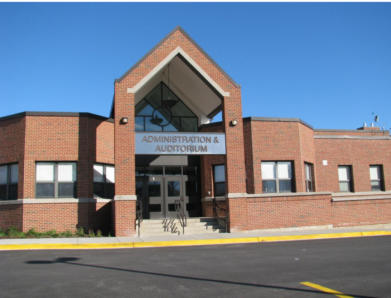
Hadley Junior High School.

District 41 thanks the community and the Board of Education for their support of this project, which has added so much to Hadley Junior High School and to the district.